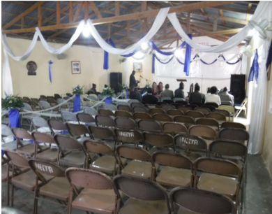
The church with fresh paint and decorated for the wedding!